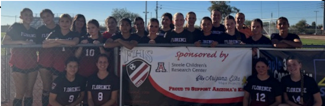
Florence High School - Girls Soccer Steele Children's Research Center is out in the communities!