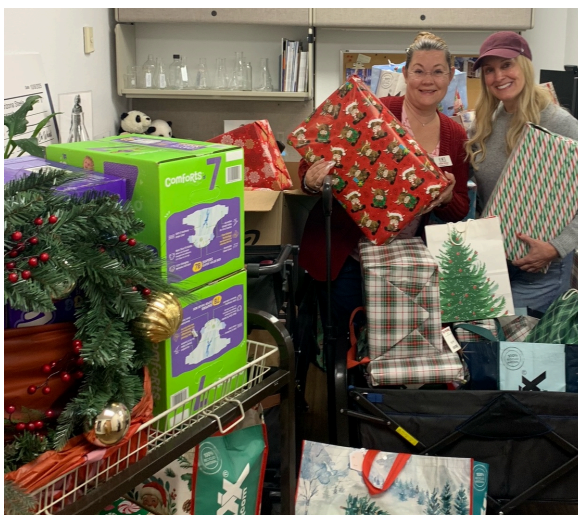
Kids of Steele (KOS) Adopt a Family They adopted 13 families this year! Read more about the families here .

They are also planning a 5k run in February 2026. More to come in future newsletters.