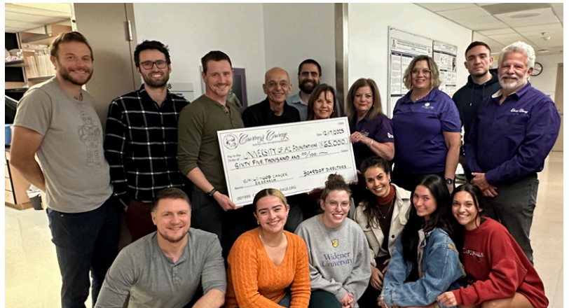
Courtney's Courage continues to support our cancer research! Read more about their mission here .

They are also planning a 5k run in February 2026. More to come in future newsletters.